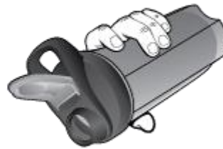
Ready to drink