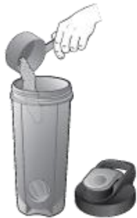
Pour in the powder