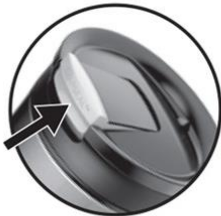
Snap up to drink.