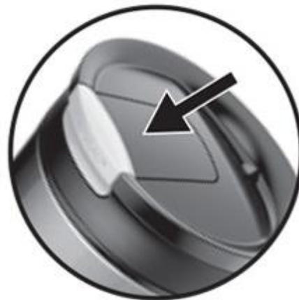
Snap down to seal.